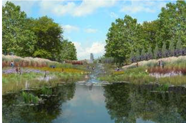
Illustration courtesy of WRT Design One of the proposals in the Floyds Fork park project master plan is to create an area where visitors could explore ponds. However, project officials and designers stress that none of the park plans are final yet. They'll be presented to the public Tuesday.

It will be released during an open house from 6 to 9 p.m. Tuesday at Christian Academy, 700 S. English Station Road.