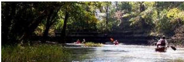
The preliminary master plan for the Floyds Fork parks project includes canoe launches and landings along the north park route. That portion would also include various sports facilities and hiking trails.