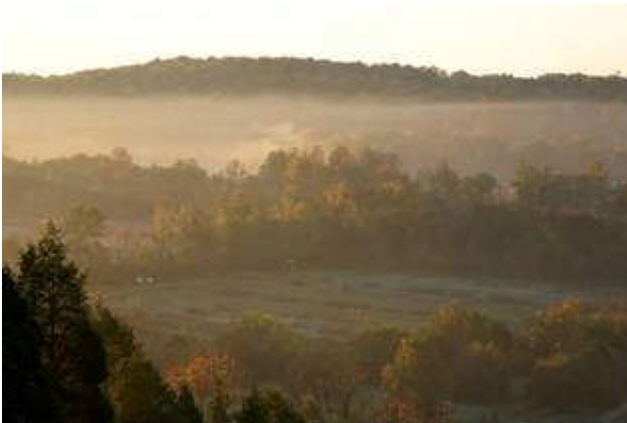
The preliminary master plan for the Floyds Fork parks project includes canoe launches and landings along the north park route. That portion would also include various sports facilities and hiking trails. (Chris Atkinson, Courtesy of 21st Century Parks)

Parks officials caution that the master plan's recommendations aren't final. They simply outline the anticipated ways a diverse collection of land -- meadows along the creek, rugged hillsides and thick woods -- will be used.